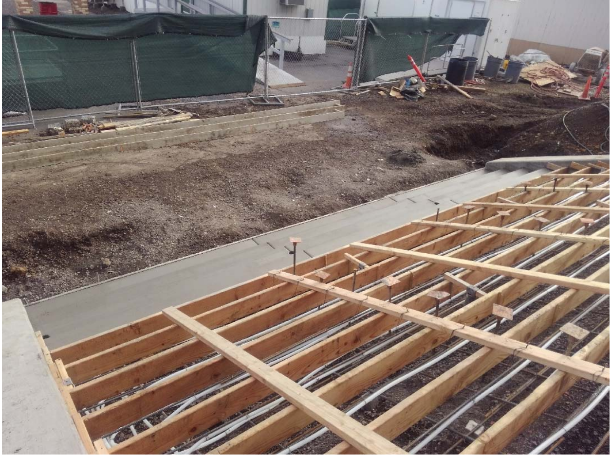
Geothermal pipes are in and the stairs are being poured.