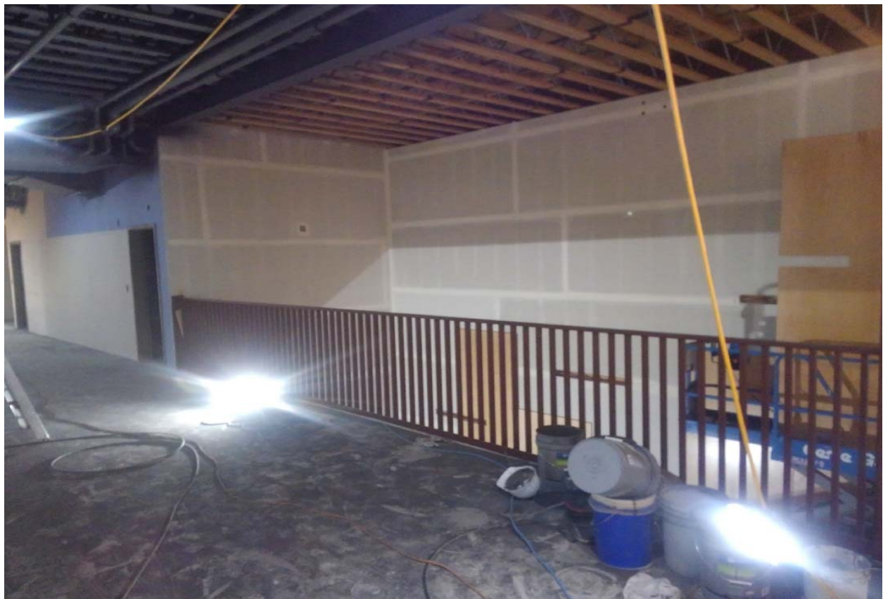
Wood wall paneling and railing is being installed at the Grand Staircase.