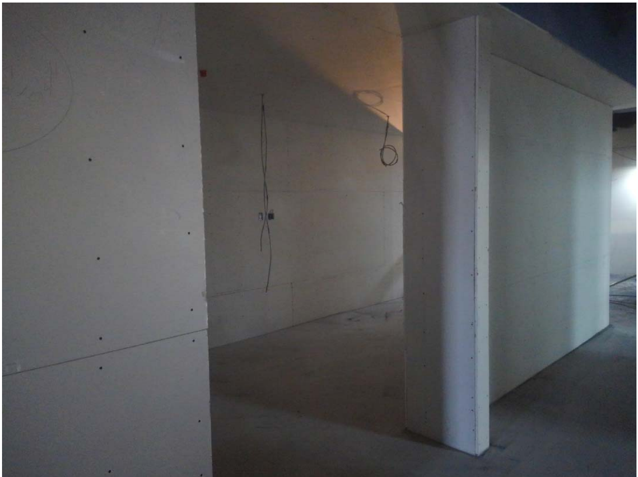
Sheetrock on the 3 rd floor...and a student work area on the 2 nd .