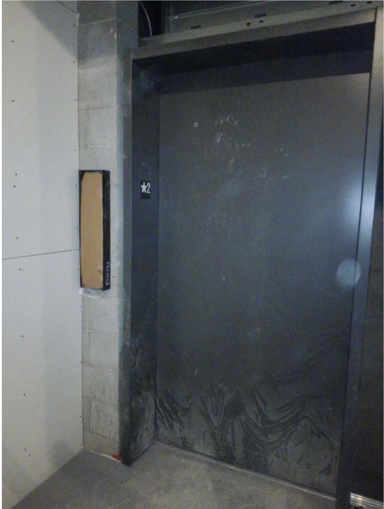
The Academic Building Elevator...in and working.