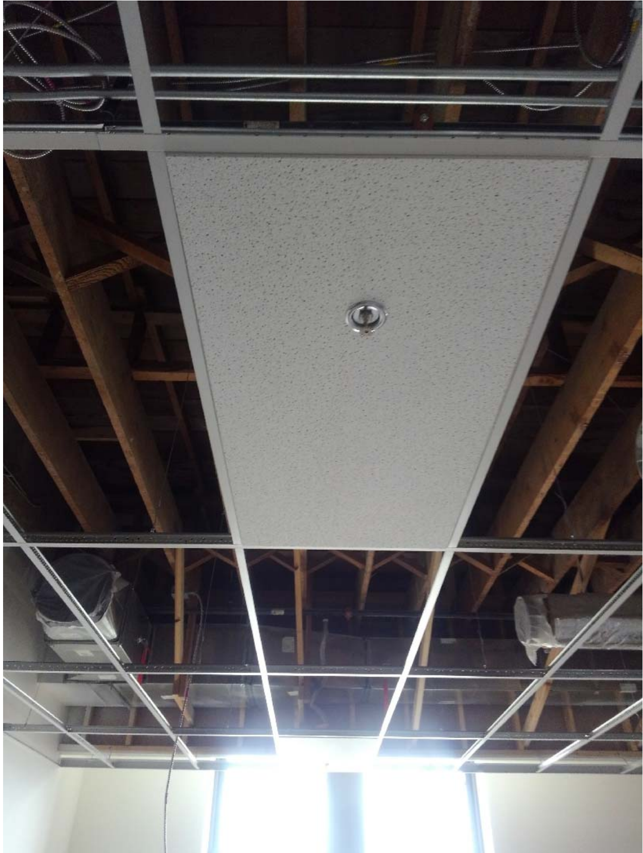
Ceiling tiles are being installed in 2 nd and 3 rd floor classrooms.